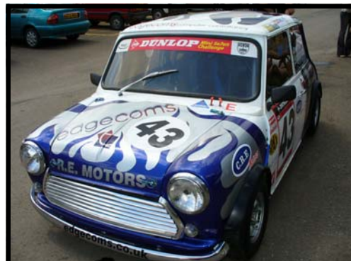
The branded 2007 Edgecoms Mini Se7en race car